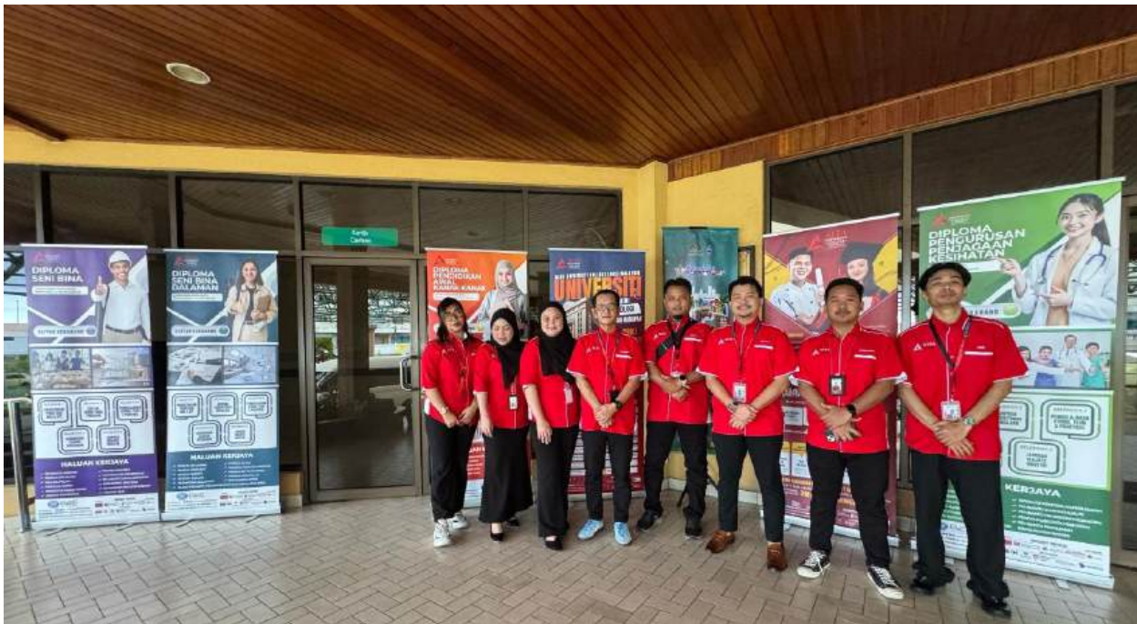
Benefits for Students